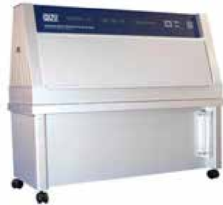
QUV® Accelerated Weathering Tester

This type of UVB light can initiate chemical reactions to occur in the coating that would normally not be possible under natural, real-world sunlight exposures. This testing has been proven to have poor correlation to natural weathering. It can cause failures in good-quality coatings that would not occur in natural sunlight, and false positives in coatings that contain low-quality pigmentation.